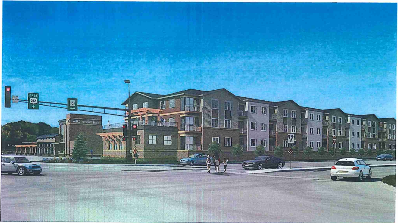
View from the Northwest SOUTHWEST VILLAGE HOUSING